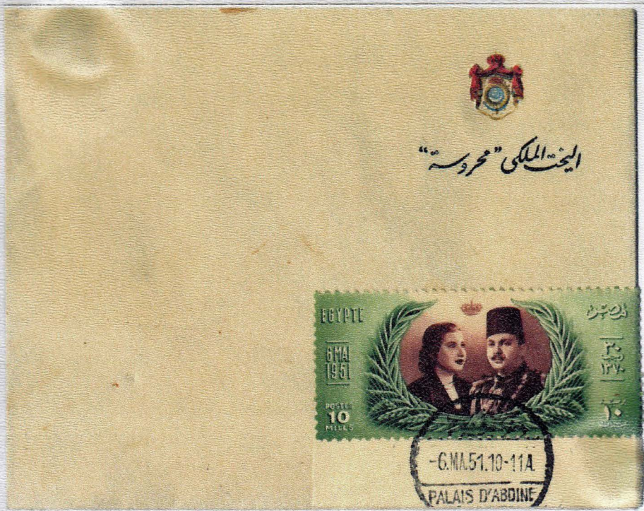
1 st DAY COVER OF THE ROYAL WEDDING OF KING FAROUK AND QUEEN NARIMAN ON AN ENVELOPE WITH COAT OF ARMS OF THE ROYAL YACHT "MAHROUSSA" CANCELLED "PALAIS D'ABDINE" 6 th MA - 51