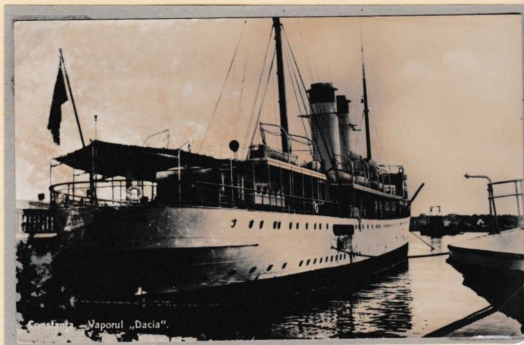
Built 1907 by Loire, St. Nazaire; 3,147 gross tons; broken up - 1961

s.s. "DACIA" was on the regular Constanta - Alexandria route at this time (with the s.s. "Romania") & possibly carried this