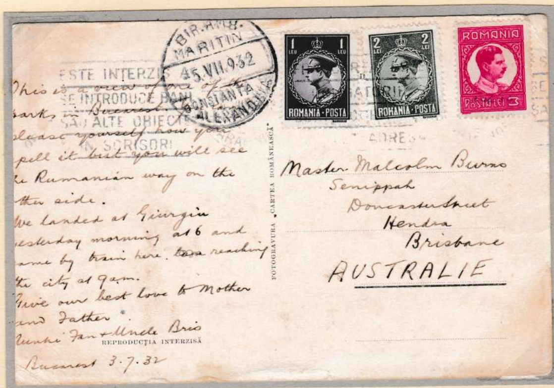
A postcard addressed to Brisbane, from Bucarest to Alexandria to connect with another ship for the onward journey. Bears the handstamp BIR AMB, 5.VII.1932, CONSTANTIA ALEXANDRIA

s.s. "DACIA" was on the regular Constanta - Alexandria route at this time (with the s.s. "Romania") & possibly carried this