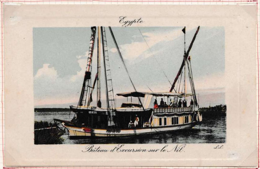
THOS. COOK EXCURSION BOAT (DAHABIYA) ON THE NILE