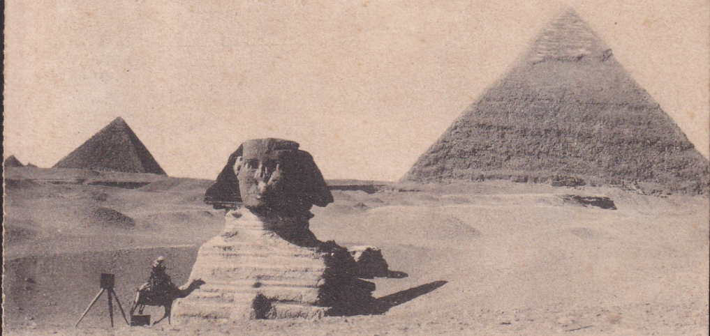
EGYPT. - Pyramids and Sphinx of Giza.