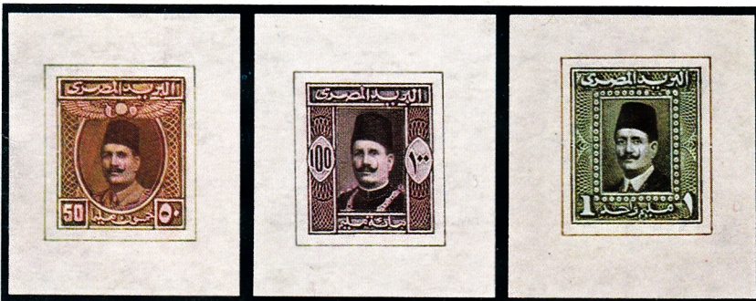
1922 Bradbury Wilkinson essays (see page 14).