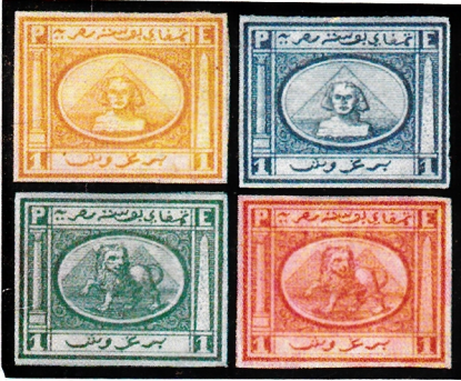
1867 Penasson Essays (see page 3).