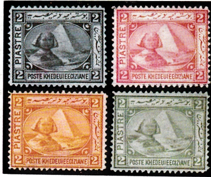
1871 Charles Skipper and East essay (see page 9).