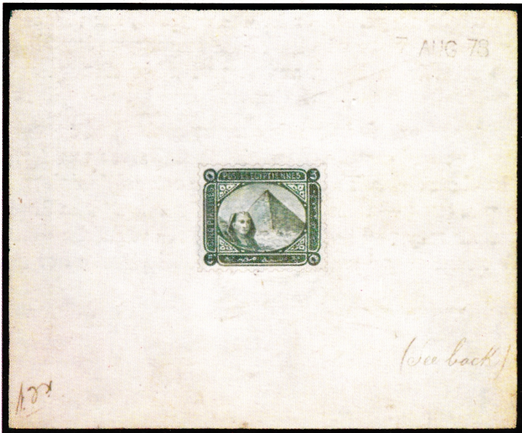
1878 De la Rue handpainted essay (see page 11).