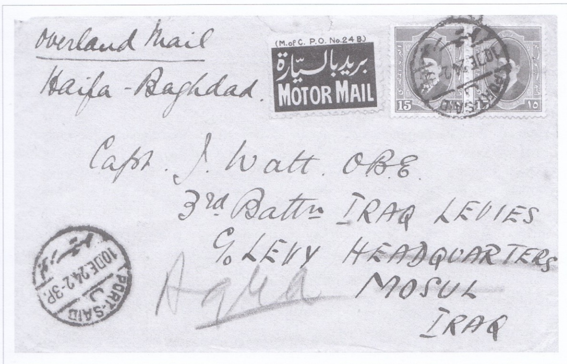
Above: cover from Port Said to Mosul by overland mail, dated 10 December 1924 and bearing stamps for 15 millièmes foreign postage plus the 15 millièmes fee for the overland service from Haifa to Baghdad.