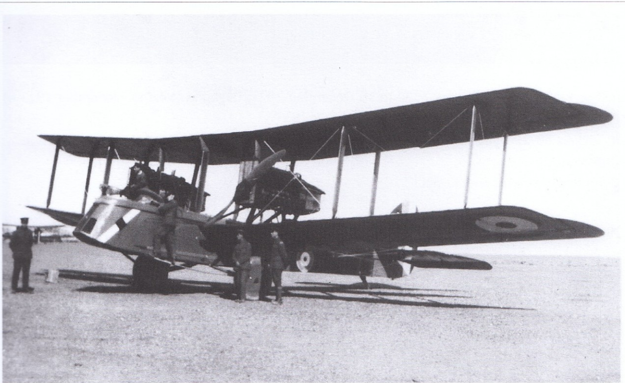
A De Havilland D.H. 10 of No. 216 Squadron at Abu Sueir airfield in 1921.

Duties Patrol and policing desert areas to protect towns from marauding bands of raiders.