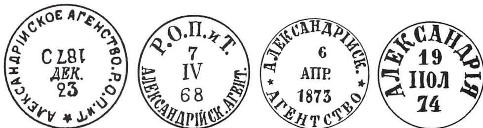
Fig. 4 The later circular date-stamps: D-2; D-3; D-4; D-5.

the date may be in two lines or three. In these date-stamps, the month may be expressed in Cyrillic abbreviation or Roman numerals; e.g., АВГ. or VIII for August. They were quite often used to cancel stamps, but the obliterator OB-1 was also used until at least 1872.