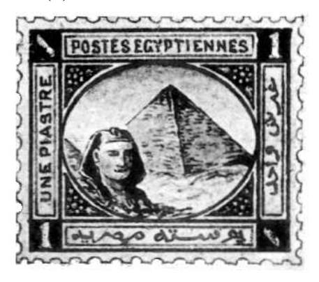
FIG.2. Artist's sketch in water colour for 1 PT. dated 7 AUG 78. Instructions to engraver, on reverse, dated 19 SEP 78. (Danson collection.)