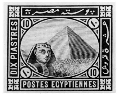
Fig.11. Die proof for 10 PT. dated 23 OCT 88. Typical vignette of Series II. Note the even surface of the sand against the pyramid compared with the heaped up sand on the 5 milliemes