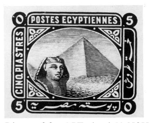
FIG.8. Die proof for 5 PT. dated 19 NOV 78. Pronounced forehead band. Compare with Fig.7 for drawing of desert foreground. (Danson collection.)