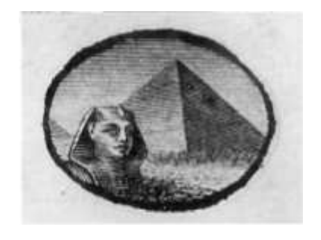
FIG.5. Die proof of vignette dated 1 OCT 78. Note the direction of the lines on the shoulder.