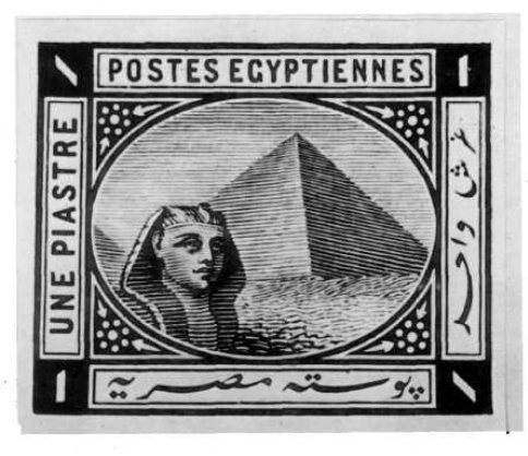
FIG.9. Die proof for 1 PT. dated 1 SEP 88, with lettering in colour-Vigneet typical of Series I designs with dark eyes and considerable portion of shoulder included in the vignette.