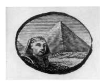
FIG.4. Die proof od vignette from a rejected design, dated 13 AUG 78. (Danson collection)