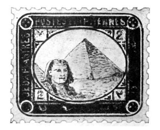
FIG.1 (a) Artist's sketch dated 7 AUG 78 (Martin Smith collection) FIG.1. (b) Artist's sketch in water colour dated 7 AUG 78 (Martin Smith collection)