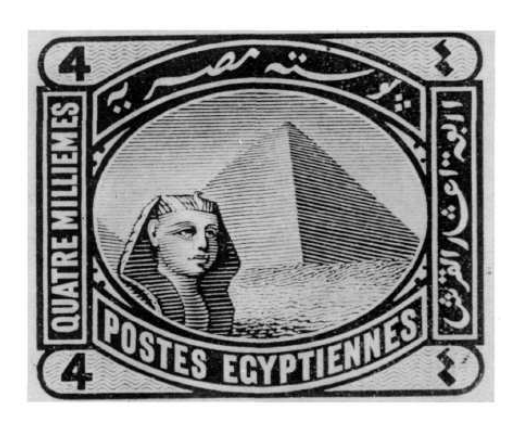
FIG. 13. Die proof for 4 milliemes, dated 18 APR 99. vignette that of the 3 milliemes, but differing in detail. The original design prepared more then seven years before the stamp was issued.