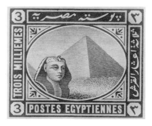
FIG. 12. Die proof for 3 milliemes, dated 11 MAY 91. The treatment of the eyes resembles Series I designs but otherwise the vignette belongs to Series II.