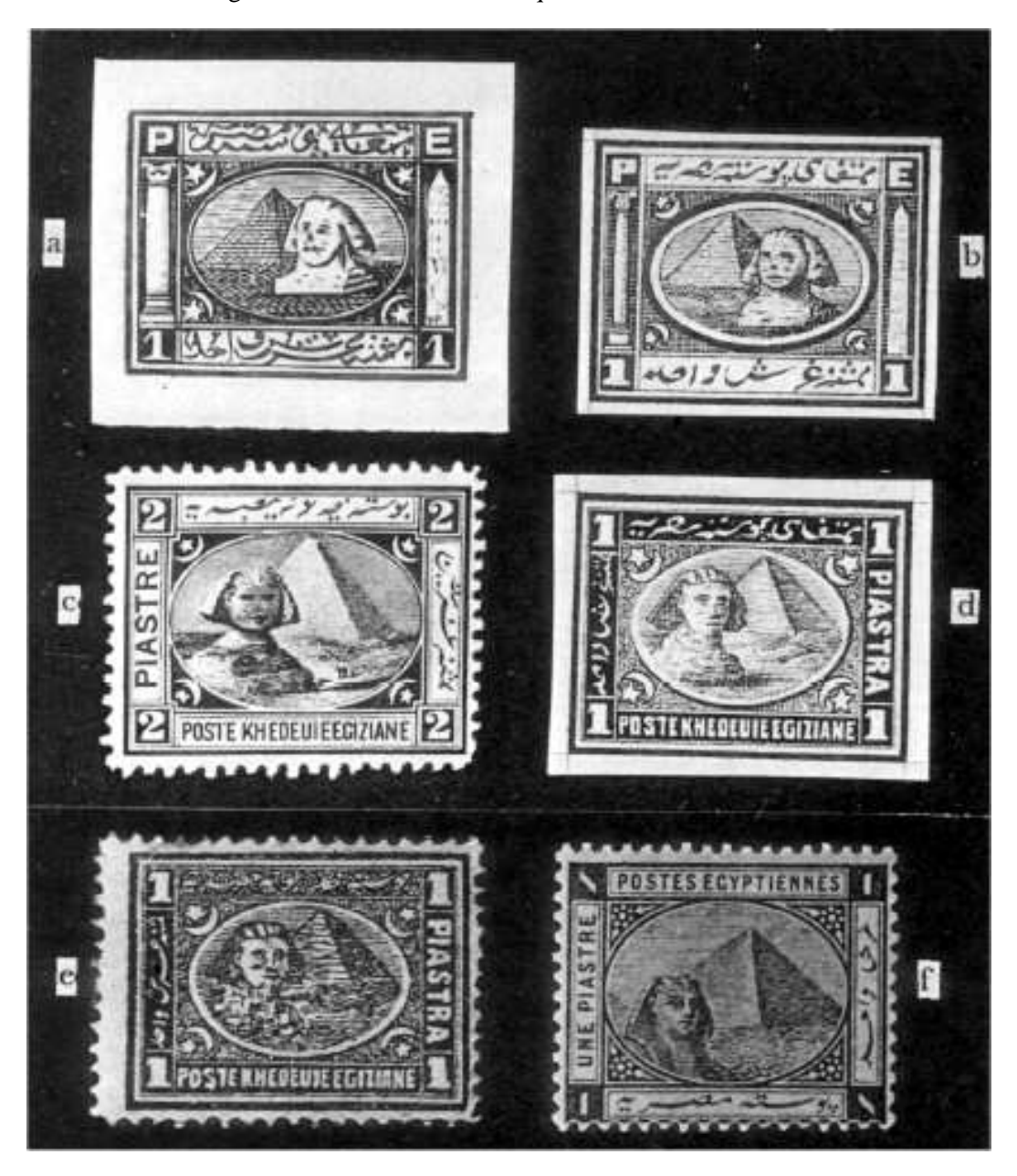
FIG.1 Evolution of the design

differing from the completed dies were shown. It would seem therefore that the study of these Egypt die proofs has thrown fresh light on the De La Rue technique.