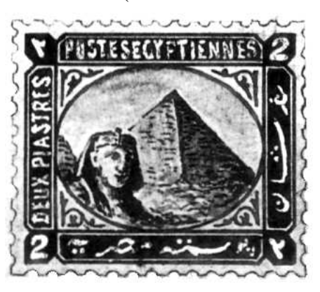
FIG 3. Artist's sketch in water colour for 2 PT. dated 17 SEP 78. Instructions to engraver, on reverse, dated 19 SEP 78. (Byam collection.)