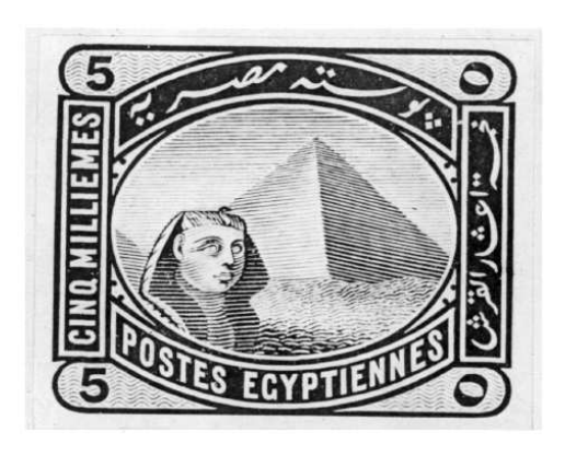
FIG. 10. Die proof for 5 milliemes, dated 22 JULY 87-Before Hardening. Vignette typical of Series II designs, with staring eyes, curved lines on left cheek and little of the shoulder showing.