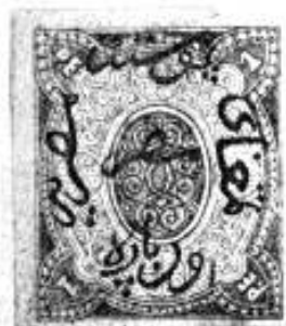
FIG. 3. The upper illustration is of the 1 P. T. stamp, printed by typography, as issued. The lower illustration is the 1 P. T. essay printed by lithography on the normal watermarked paper. The background in the corners is composed of crossed lines. A complete printing stone must have been prepared as a block of six of this essay exists in the Byam collection. The incorrect superscription it bears is also lithographed

As can be seen from the illustration (Fig. 3), a design was prepared for printing the 1 piastre by lithography. This was modified slightly when the die for the typographed stamps was cut. The lithographs, which must be regarded as essays, are printed on the normal watermarked paper and closely correspond in colour to the issued 1 piastre stamps. Similar lithographed essays by Pellas; on the paper of the issued stamps are :5 para with lithographed 'superscription 10 piastres, and 2 piastres with lithographed superscription 20 para. C. D. Rawson has recently discovered a 5 para essay with the superscription of another value.