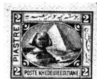
FIG. 2. Essay by Charles Skipper and East. As this includes the title Khedive it cannot be earlier than May, 1867.

In 1863, Muzzi called for tenders from various firms specialising in the printing of postage stamps and received offers from Pellas Brothers, of Genoa ; the Press of the Imperial Court of Vienna; and an English company, the name of which was not quoted but may have been Charles Skipper & East as the records of this firm, now lost as a result of the war, suggested that they tendered for stamp production for Egypt at an early date. The essays by Skipper and East, with which we are familiar, carry in the inscription the title Khedive (Fig. 2), and as this was not granted to the ruler of Egypt by the Sultan of Turkey till 14th May, 1867, it is safe to assume that these essays were not prepared in response to Muzzi's original request.